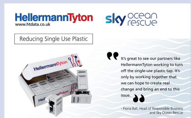
HellermannTyton Social Media Campaign.

SKY – SKY Ocean Rescue, Pass on Plastic campaign have worked with HellermannTyton in stamping out single use plastic. All SKY deliveries of copper patch leads, fibre patch leads and POD boxes will be supplied WITHOUT polybags and now in recyclable cardboard boxes.