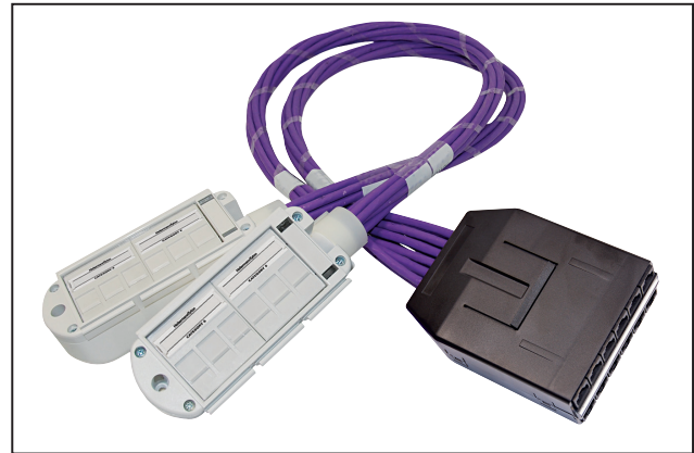
RapidNet 12 Port Category 6 Cassette to Split Pod

RapidNet Category 6 looms are available in lengths from 5m to 90m.