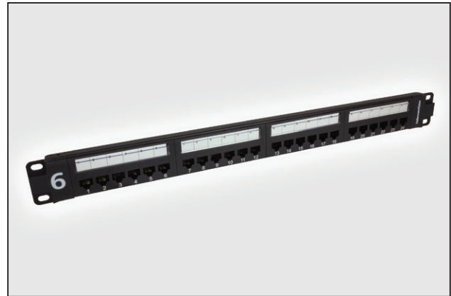
HTC Series CAT6 Unshielded Patch Panel