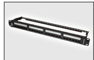
HTC Series CAT6 Unshielded Patch Panel with Rear Cable Management