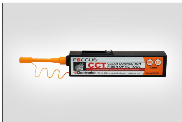
HT-FPC-CC125 - Cleaning tool for MU and LC connectors