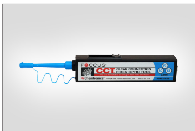
HT-FPC-CC250 - Cleaning tool for FC, SC and ST connectors