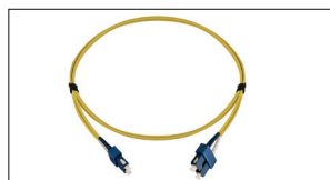
Fibre Patch Leads SC to SC Single Mode