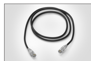
RJ45NGB in black.