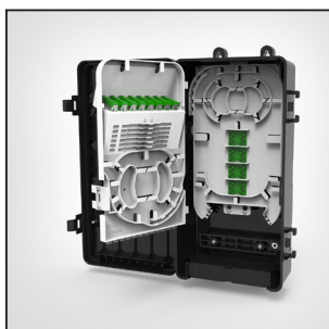
Drop management tray shown open.