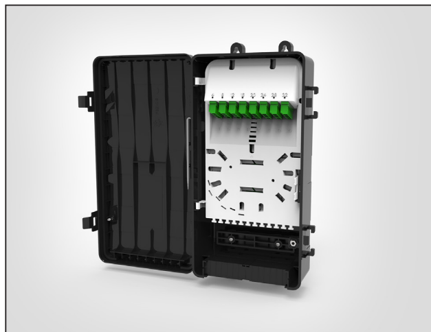
AFN with 32 connections.

The enclosure is also available in an LC/PC format.