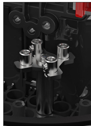
R Port Anchor Kit mounted onto a base.