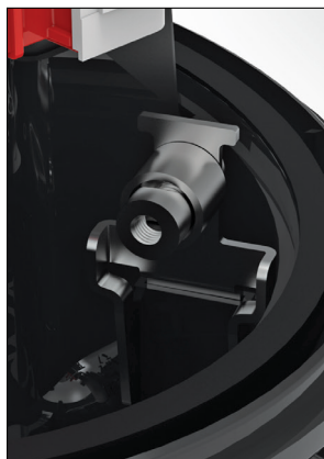
B Port Anchor Kit mounted onto a base.