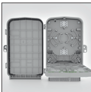
Fibre Splice Management Tray.