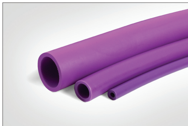
Direct Buried / Thick Walled / HDPE.