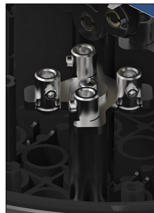
R Port Anchor Kit mounted onto a base.