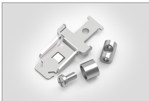
B Port Anchor Kit.