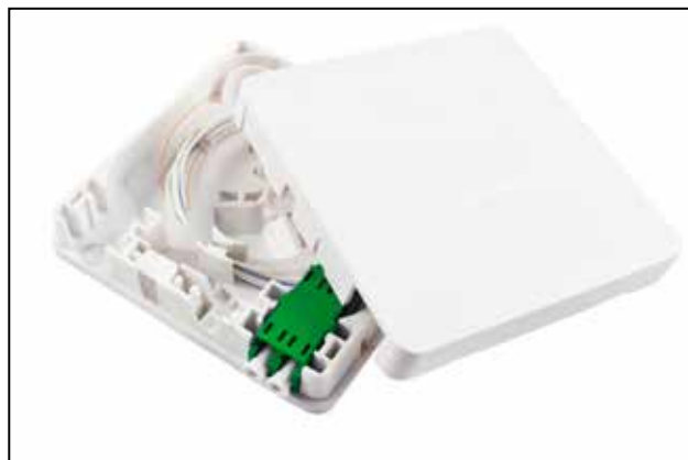
Fibre Wall Outlet with Pigtail and LC Adaptor