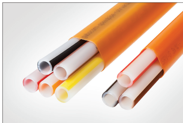
SpeedPipe bundles ground for direct burying.

To offer compatible end to end air blown ducted solutions, HellermannTyton manufactures its own in-house range of connecting and sealing elements.