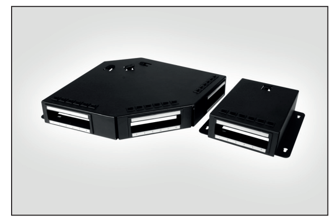
RapidNet Floor Boxes - Triple Cassette and Single Cassette.

The RapidNet Floor Box can be fixed to the floor or under the floor using several fixing points. The RapidNet Floor Box is manufactured from powder coated mild steel and has dual magnified labelling fields for easy port identification.