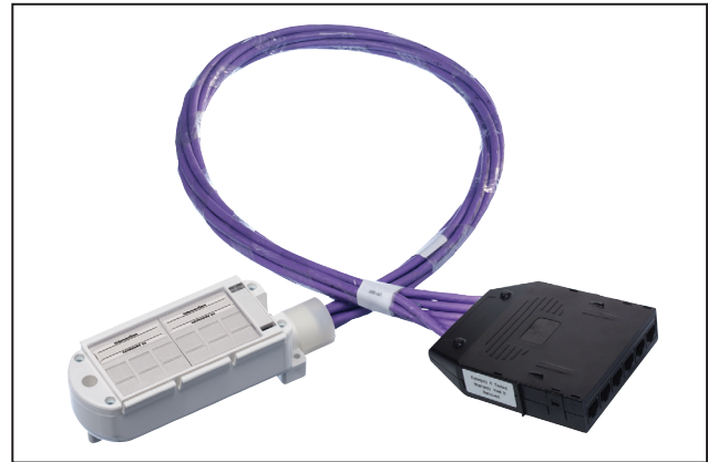
RapidNet Category 5e Cassette to Pod

RapidNet Category 5e looms are available in lengths from 5m to 90m.