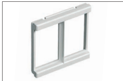
6C Category Angled Module