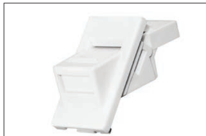
6C Category Angled Module