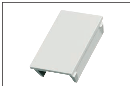
6C Category Half Blanks