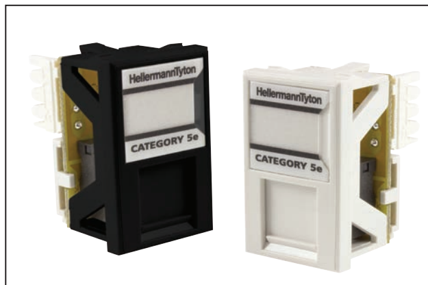
6C Category 5e UTP Single Outlet

The 6C Category 5e single outlets are designed to support Ethernet 10BASE-T, 100BASE-T (Fast Ethernet), 155 Mb/s ATM, Token Ring 4/16, voice/data systems and Voice over Internet Protocol (VoIP) systems running over a Category 5e cabling system and is backwards compatible with existing Category 5 and voice network infrastructures.