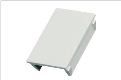
6C Category Half Blanks