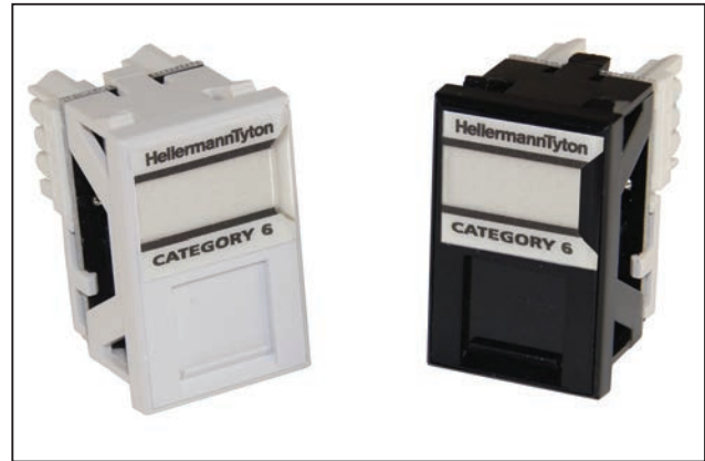
6C Category 6 UTP Single Outlet

6C Category 6 unshielded single outlets are designed to support Ethernet 10BASE-T, 100BASE-T (Fast Ethernet), 1000BASE-T (Gigabit Ethernet), 155 Mb/s ATM, Token Ring 4/16, voice/data systems and Voice over Internet Protocol (VoIP) systems running over a Category 6 cabling system and is backwards compatible with existing Category 5e, Category 5 and voice network infrastructures.