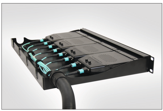
RapidNet 1U MTP Fibre Patch Panel loaded with Cassettes.