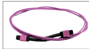
OM4 MTP Back-bone Cable