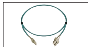
Fibre Patch Leads SC to SC Multimode