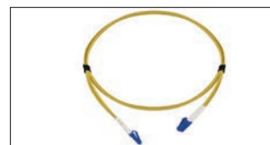
Fibre Patch Leads LC to LC Single Mode