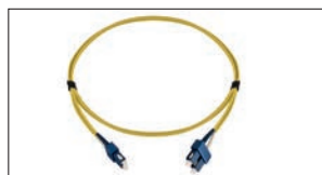
Fibre Patch Leads SC to SC Single Mode