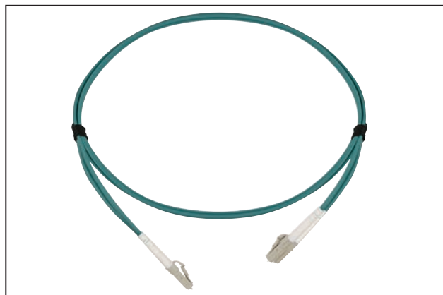
Fibre Patch Leads LC to LC Multimode

All patch leads are supplied as a crossover configuration as standard, straight through patch leads are available on request.