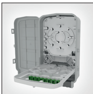
250µm splice only.