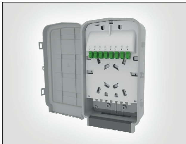
MDU - S1 with 8 LX SX connections.