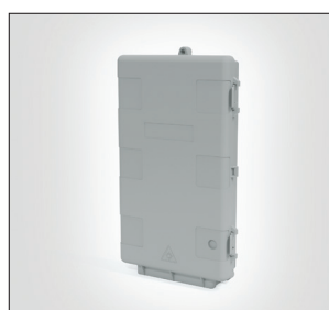
External view of MDU S1XS.