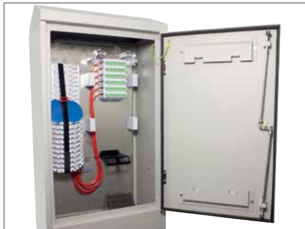
Point of Connection (POC)

Each splitter assembly consists of a pre-assembled fibre splice tray with a single pre-installed 1 x 8 splitter and 1 3A splice bridge. The splitter is pre-connectorised with 8 LC Simplex 900µm output fibres. These are routed to an 8 port LC Simplex drop patch module and connected to 8 LC Simplex adaptors. The additional trays are fitted with 2 splice bridges to accommodate a maximum of 16 3A splices.