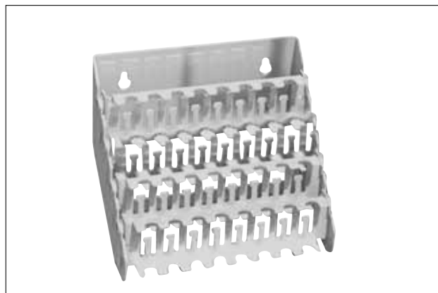
Customer Drop Management Bracket

The Customer Drop Support Brackets are manufactured from stainless steel and provide individual support and anchoring for the customer drops from the Drop Patch Module Holder. The brackets are available in 3 sizes 32, 48 or 64 drops and can accommodate 5, 7 or 8mm diameter drops. The brackets can be retrospectively fitted allowing the system to expand as customer uptake increases.