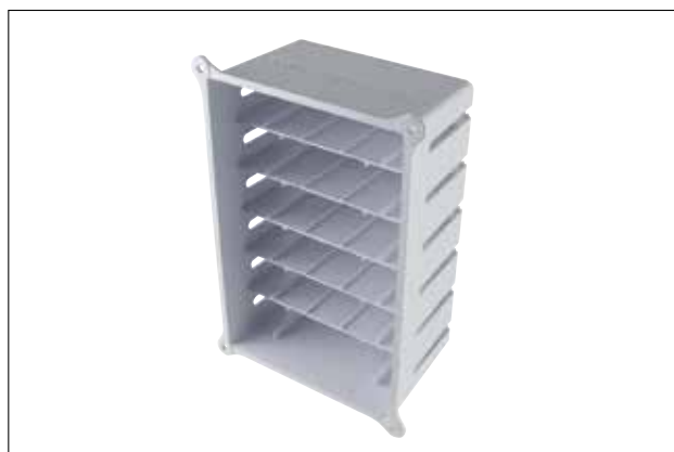
Drop Patch Management Holder

The Drop Patch Module Holder has been designed to be retrospectively fitted allowing a pre-existing installation to be expanded. Each Drop Patch Module Holder accommodates a maximum of 6 Drop Patch Modules, each of which accommodates 8 LC Simplex connections, which can be added to the system retrospectively.