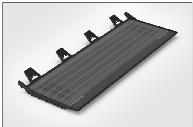
G-Wrap-400mm Seal shown lying flat.