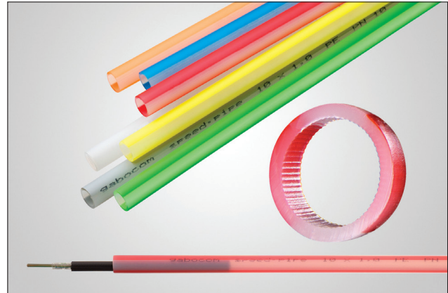
Direct Installed / Thin Wall / HDPE.