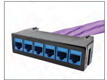
Short Body RapidNet in Blue