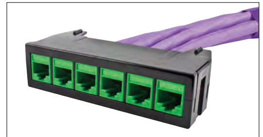
Short Body RapidNet in Green

The angled panel is available in both 1U and 2U options. A range of accessories completes the angled panel solution including rear cable management and 2 types of cover, designed to maintain consistent airflow within a cabinet or rack.