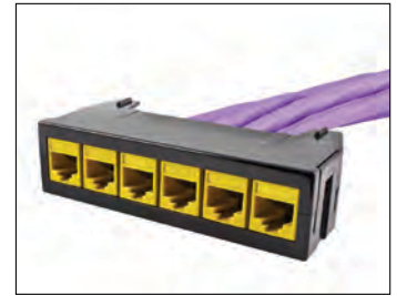
Short Body RapidNet in Yellow

Part number given is for a 10.0m loom as an example. Other lengths are available from 10m to 90m on request. Additional second end options are also available, including cassette to GST Jack, cassette to plug (Category 6 and Category 5e only) and cassette to bare end. For further information please contact our sales team.