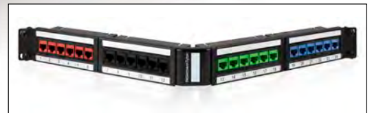
1U RapidNet Angled Panel