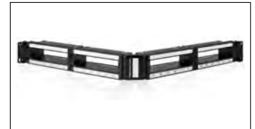
1U RapidNet Angled Panel