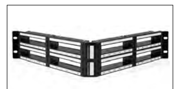
2U RapidNet Angled Panel