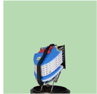
A Length FDN Closure