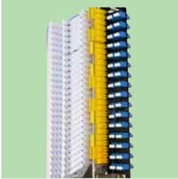
Connector Plate Takes Up To 64 LC Connectors