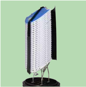
B Length FDN Closure