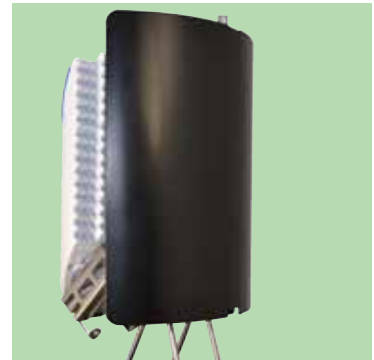
Metal Casing To Protect Fibre Connectors