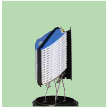
AB Length FDN Closure