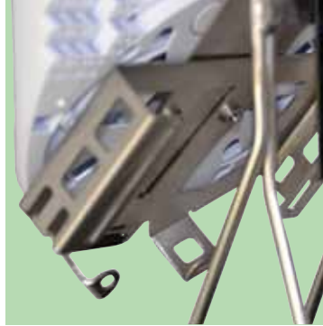
Optional Loop Storage Basket