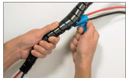
Simply slide the applicator tool through the Helawrap cover.