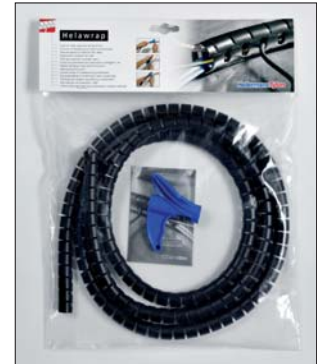
Helawrap, the fast and easy solution to your cable chaos, available in 2 sizes and 3 colours!