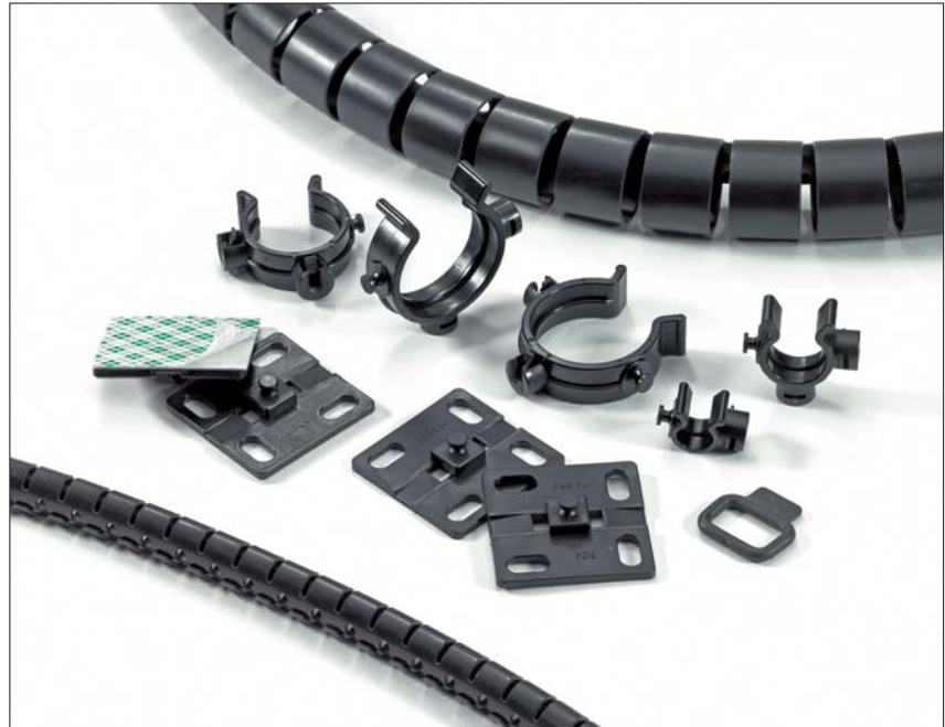
The Helawrap accessory set for bundling, fixing and protecting multiple cable runs.

Helawrap clips and mounting plates can be linked into chains to bundle, protect and fix any number of cables on industrial machines. They can also be used in wiring cabinets, particularly in the door area where movement is a requirement. Helawrap accessories are also used to manage cables in the office or home.