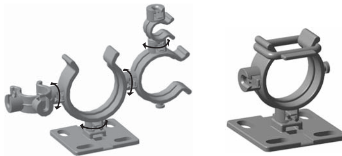
Multiple clips can be joined. Clips swivel freely.