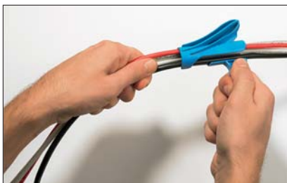
Insert one or more cables into the insertion slot of the applicator tool.