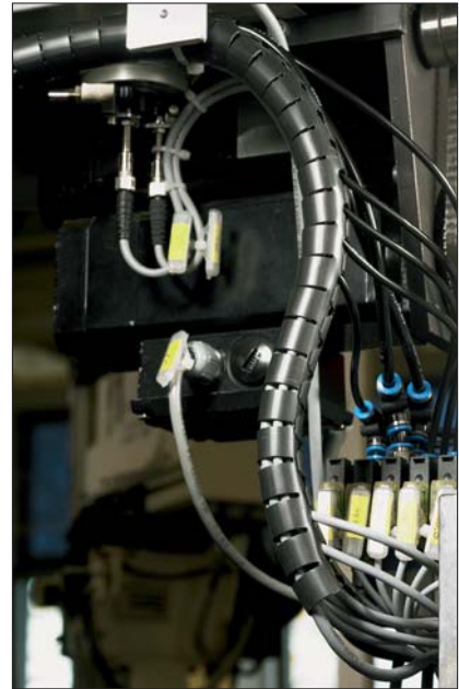
Cables can be branched off at any point for better, more flexible protection.

Helawrap in practical 2m lengths is designed for domestic and office use. It puts an end to the cable chaos associated with PCs, TVs and Hi-Fi systems.