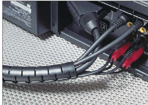
Complete cable management for home and office.

Helawrap in practical 2m lengths is designed for domestic and office use. It puts an end to the cable chaos associated with PCs, TVs and Hi-Fi systems.