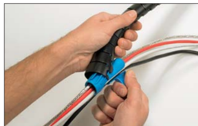
Place the applicator tool in one end of the Helawrap cable cover.